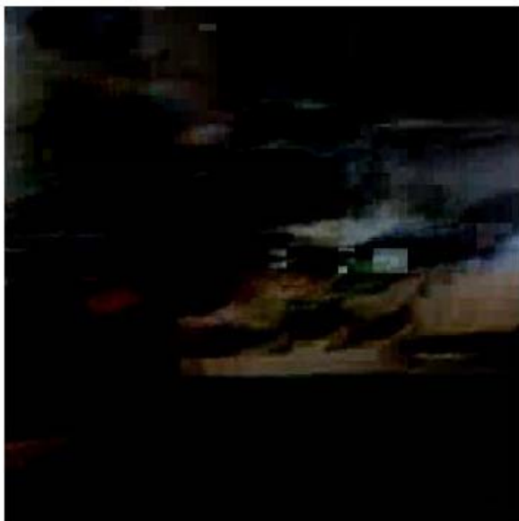
Difference Image, Regular Camcorder