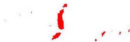
Difference Image Thresholded, SkEyesCam