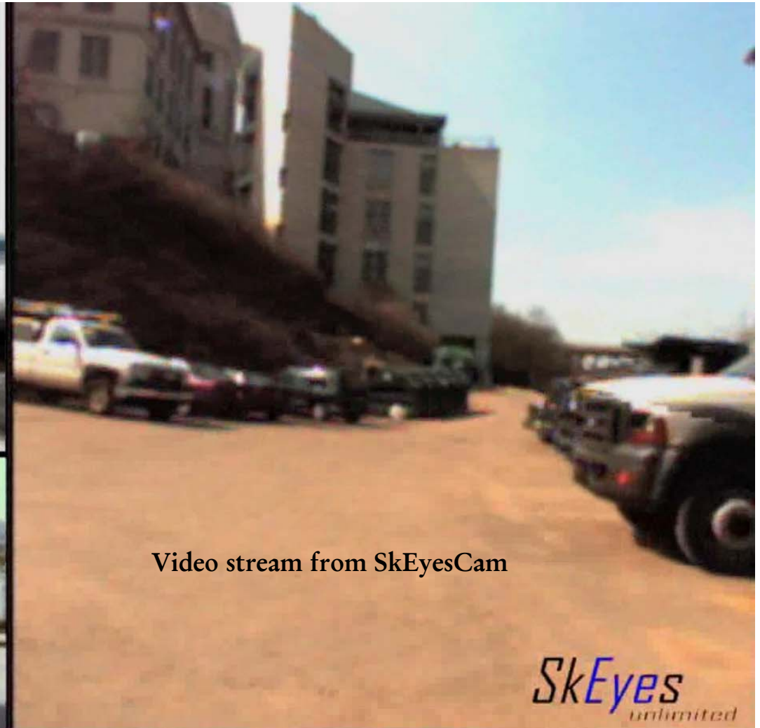
Video stream from SkEyesCam