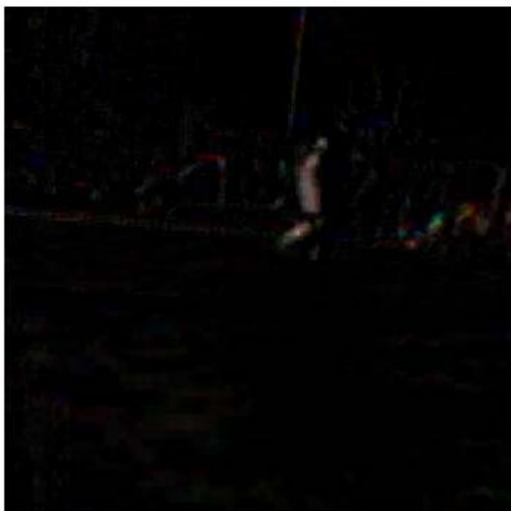
Difference Image, SkEyesCam