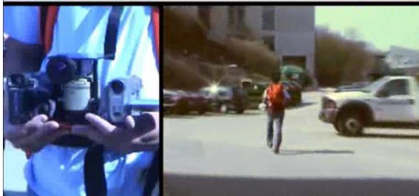
“Running man” setup