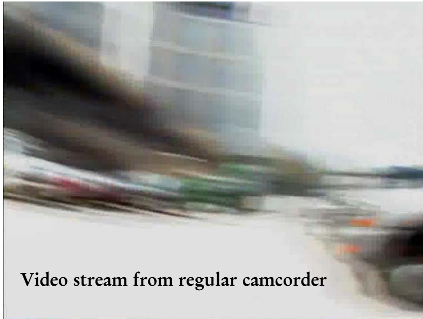
Video stream from regular camcorder

A man collects situational awareness imagery by running with the SkEyesCam and a regular camcorder strapped to his shoulders.