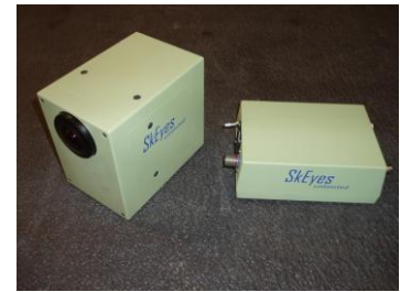
SkEyesCam camera enclosure and processor.