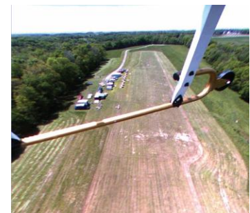
Stabilized image of a portion of the scene